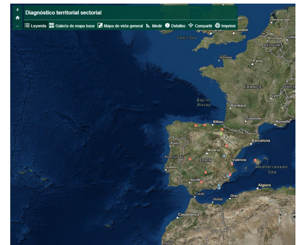
Fig. 2. The highest level of satisfaction are the red points (5/5) follow by blue (4/5) and green (3/5)

Students learn different competences, which extend beyond the content of the science itself.